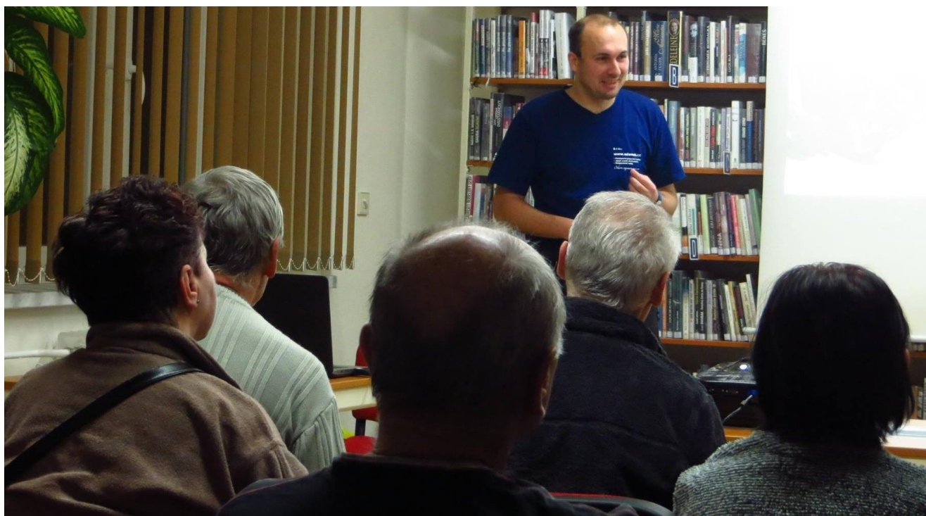
Travelogue presentation, 2015